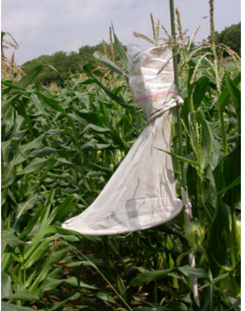
Photo B. Heliothis net trap with corn earworm (CEW) lure in silking sweet corn for monitoring arrival and population of CEW. Note that the base of the trap, where the lure hangs, is at the level of the corn silks. Because of the very heavy moth pressure at this site (>50 moths per week), counting was made easier by covering top with plastic bag and inserting a vapor strip.

traps baited with corn earworm lures can be used. Blacklight traps can be placed near corn fields, but not necessarily in them, and give a reasonable estimate of populations up to one mile away from fields. Traps should be checked daily, and capture of any corn earworm moths should trigger treatment [1]. The pheromone trap should be placed in freshly silking corn with the lure at ear height (photo B). Lures are suspended in an opening at the base of the trap and replaced every two weeks. Two traps per field, at least