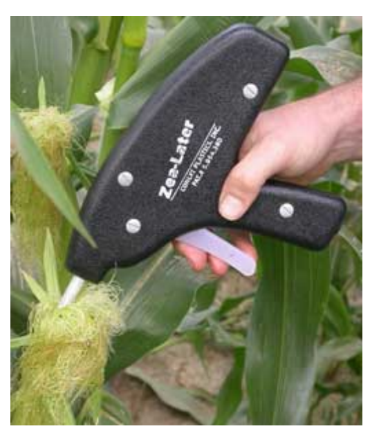
Photo C. Zea-later oil applicator being used to apply oil/Bt treatment to corn silk.

tiveness of this material under a range of corn earworm pressures and spray intervals. Growers who would like to use this method should refer to existing publications on sprayer design and spray coverage for effective control of corn earworm [1, 9].