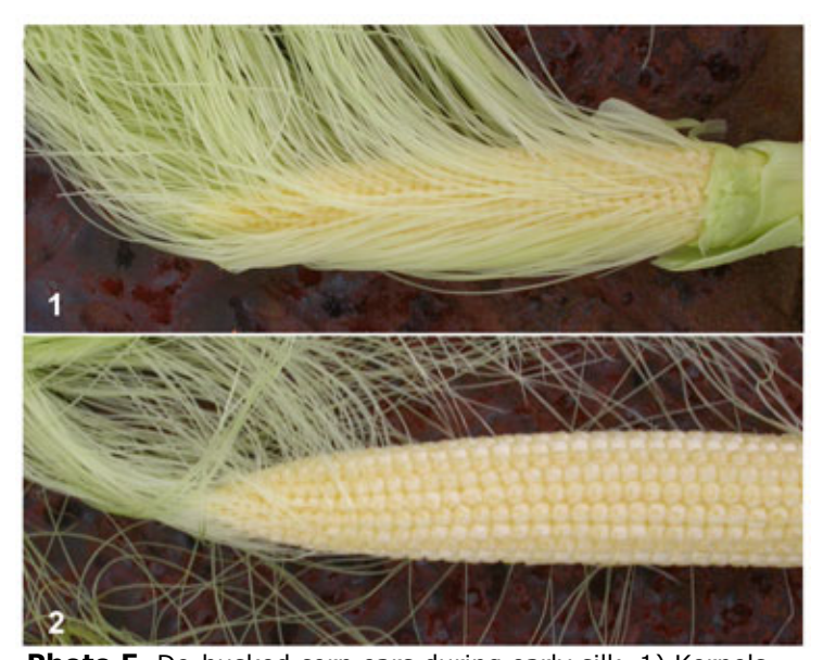
Photo E. De-husked corn ears during early silk. 1) Kernels have not been fertilized, ear is too young for oil treatment. 2) Only kernels at tip have not been fertilized. Oil should be applied at this stage.

<u>Insecticides:</u> Bacillus thuringiensis subsp. Kurstaki. Corn earworm larvae feed on silks as they move down the silk channel, then feed on the tip of the ear. Early in ear devel-