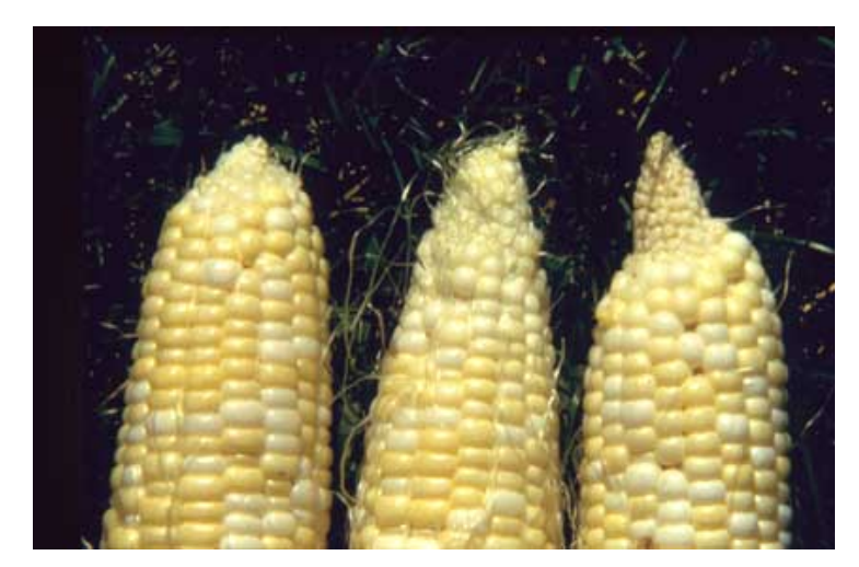
Photo D. Sample of corn ears at harvest. Ear on right has cone-tip from oil application. The other two were not treated with oil; the tip fill of the center ear is incomplete, a condition that occurs in some varieties or under certain environmental conditions. Oil application does not always result in cone-tip.

Applications made earlier than five days after silk do not appear to give better control and may result in a higher rate of "cone" tips (photo D). Cone tip develops when oil interferes with pollination of the silks that are attached to the tip of the ear, which are the last silks to develop. This results in unfilled kernels in the last half-inch of the tip. While partially-filled tips are a relatively common occurrence in sweet corn, the lack of kernel growth caused by oil is more pronounced.