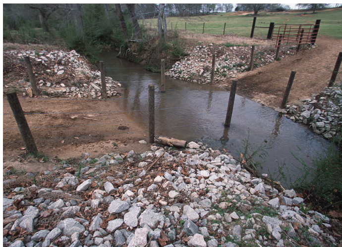
Figure 1. Example of a limited access watering area.

A hardened crossing is a designated crossing area that has a hardened bottom, usually rock or gravel, that provides livestock with firm footing and discourages congregating in the stream (Figure 2, page 2). When creating hardened crossings, placing them in areas that livestock currently use to access the stream is important.