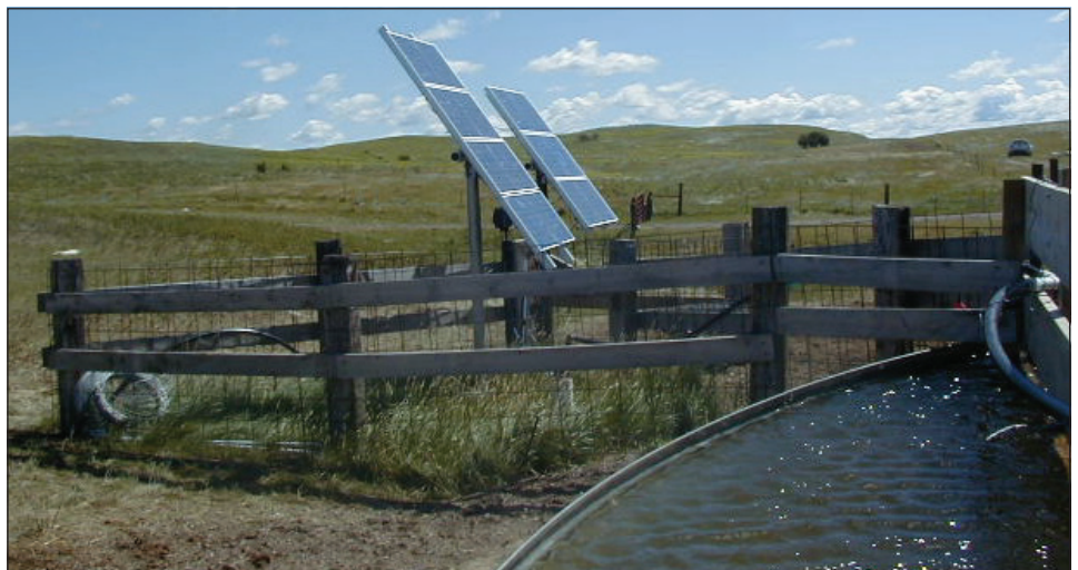
Figure 4. Example of a solar-powered watering system.

Due to the irregular flow associated with solar systems, either a storage tank or a large tank needs to be used because these systems need to be able to store three to seven days of water to ensure livestock have a constant source of water.