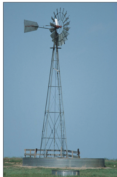
Figure 7. Example of a windmill water system.

In areas where alternating-current (AC) electrical power is readily available, an AC-powered pump is the best choice for pumping water. Electric-powered systems are the most cost effective for powering a pump. Pumps powered by electricity require very little maintenance and provide a more dependable flow of water to the tank, thus tanks are only required to hold a two- to three-day supply of water.