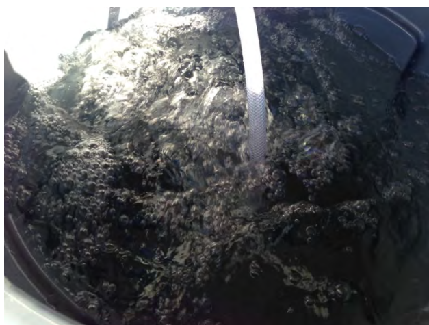
Robust aeration and agitation