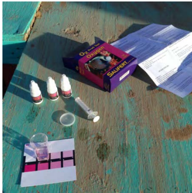
Salifort brand DO test kit