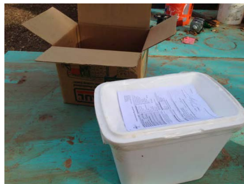
Packed up and ready for overnight mailing