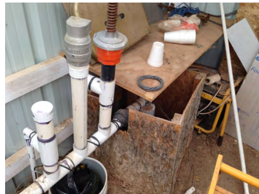
water source- 200' deep well