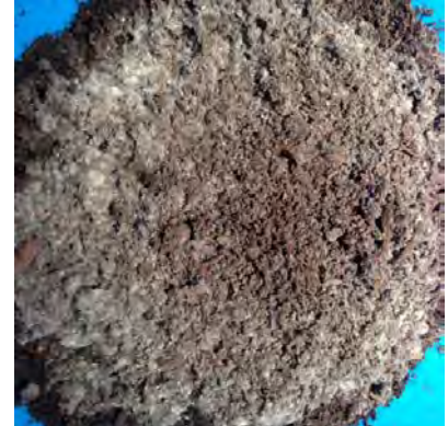
oat, soybean and garbanzo flour are good pretreatment food sources after 7 days growth

2. Operator health check. As with all activities related to handling food crops, we only work when we are healthy and always wash our hands prior to brewing compost tea.