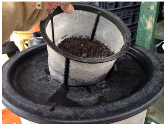
adding compost to brewer- note that basket is not too tightly packed

8. Add compost. We add the compost to our 1000 micron basket after the pump is turned on. This assures that no tea ever gets into the air line. The air line is harder to clean and can be overlooked. Pathogens can build up in the air line if it comes into contact with tea.