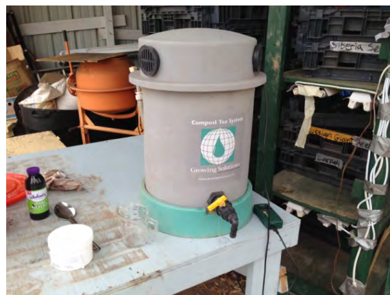
covered brewing area

3. Prepare brewing area. We set up the brewer such that we will not need to move it after we add water and begin brewing. All equipment and materials are prepared. Note that brewing occurs in a covered area out of direct sunlight.