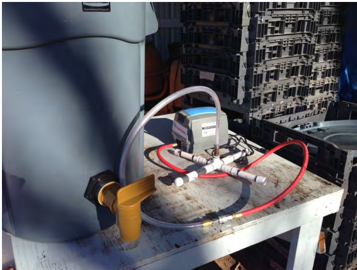
Diffuser assembled and attached to air line