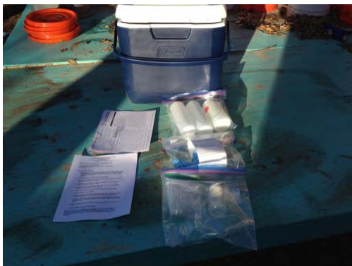
Water quality test bottles provided by testing lab