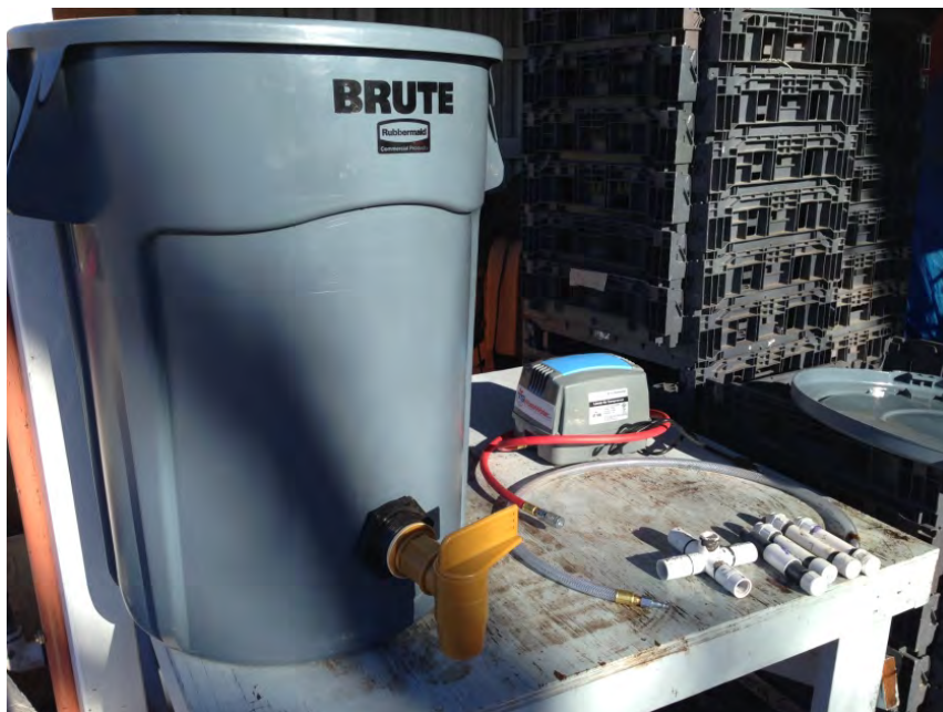
Brewer consists of 1) 45 gallon garbage can with spigot, 2) quick release air line, 3) pvc diffuser, 4) heavy duty air pump.