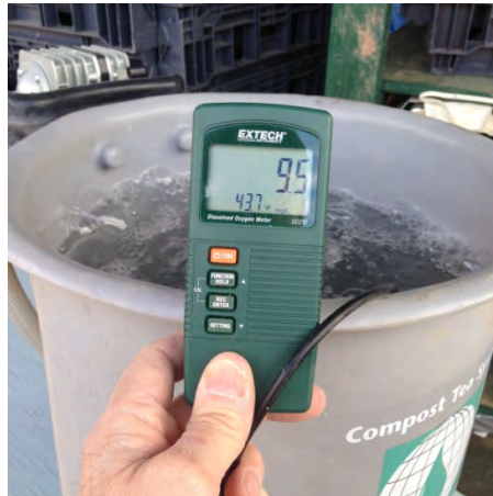
DO level in brew water is raised to 10 mg/L

7. Test DO at beginning of brew cycle. We test the water for DO level prior to beginning brewing to assure level is 8 mg/L or higher.