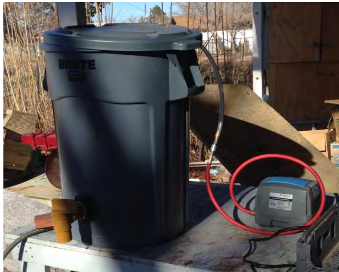
Unit assembled and ready to go!