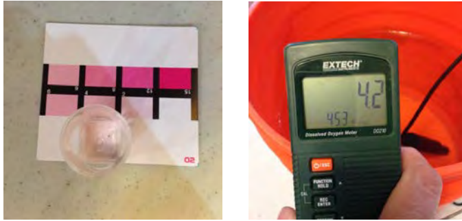
Well water initially at 4 mg/L DO- too low to brew

4. Fill brew tank with water. Since we use well water that comes out of the ground at a uniform 55 degrees F. and a DO level of 4mg/L, we let the water sit for at least 8 hours to reach ambient air temperature of approximately 70 degrees F.