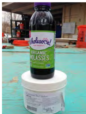
food sources for microbes- Brand X blend and unsulphured molasses