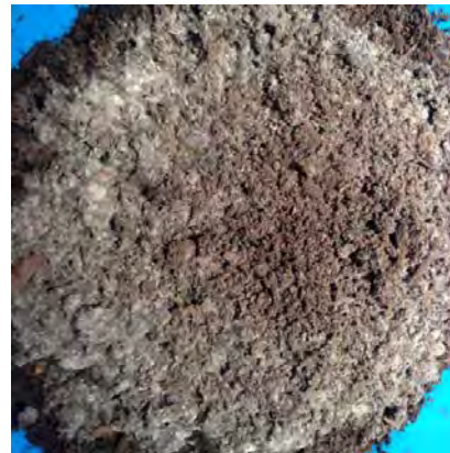
compost after 7 days- white is fungal growth

10. Adding food sources to the brew will greatly increase the microbial population BUT it is critical to assure that the DO level never falls below 6mg/L. Pathogen microbes are more likely to develop in an anaerobic brew. There are an endless number of food sources that can be added. There are also many premixed additives on the market.