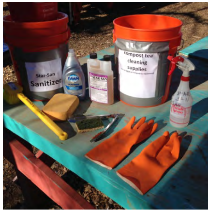
cleaning supplies including StarSan sanitizer