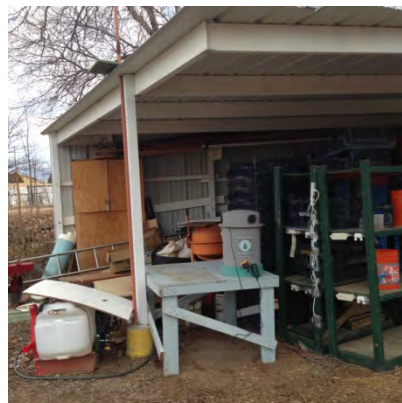
covered brewing area