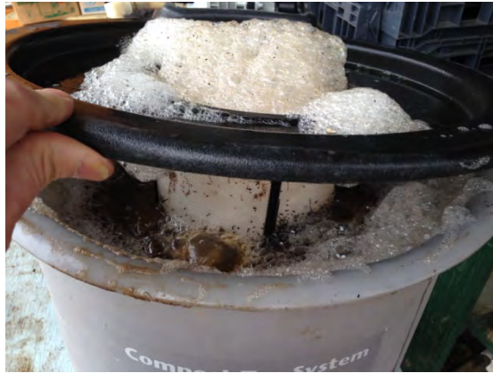
Foam after 24 hours brewing- indicates good microbe growth

10. Allow to brew. We brew 24-48 hours, mostly based on ambient air temperature. In summer when temp is 80 degrees F we brew 24 hours typically. In fall or early spring with temp at 60 degrees F we often brew 36-48 hours. Experience (and testing) will be your guide to brew time.