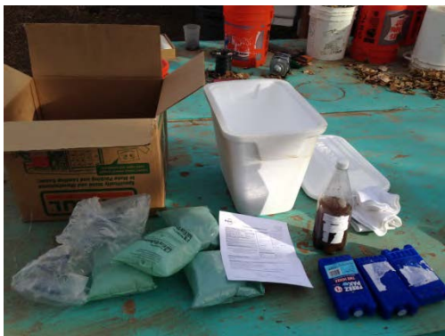
Compost tea and packing supplies