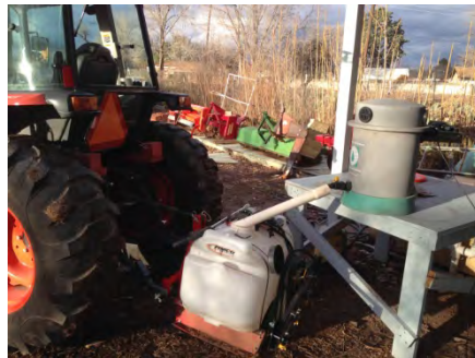
filling sprayer for foliar application

12. Cleaning of equipment is perhaps the most overlooked aspect of brewing tea. Most brewers have spaces that come into contact with tea that are hard to clean. Careful consideration of the cleaning and sanitizing process will minimize potential for pathogens. .