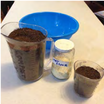
pretreating compost with oat flour