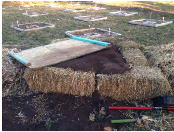
covered compost storage at the farm

6. Assuring pathogen free, chlorine free water is critical to quality compost. Special Note: well water coming directly from the ground is often at 4 mg/L or less of dissolved oxygen when first pumped out. Running the aerator pump for 1-2 hours prior to brewing will usually solve this problem.