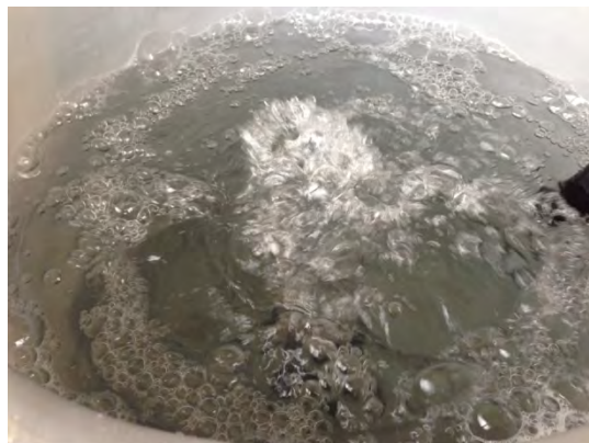
raising the DO level by aerating

6. Aerate water for 2 hours. We turn the air pump on approximately 2 hours prior to brewing to raise the DO level from 4 mg/L to 10-12 mg/L. This also allows us to test our pump, assure that air diffuser is working correctly and verify our power source. If using municipal water, aerating will dissipate the chlorine.