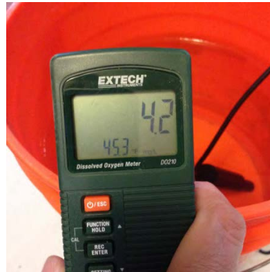
Extech brand DO meter

8. For purposes of creating a validated process it is necessary to test at least one batch of finished compost tea. Most farmers will also want to have their compost tea tested for microbial levels. Dedicated enthusiasts will purchase a quality microscope and learn how to recognize the variety of microbes.