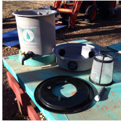
Growing Solutions 10 gallon brewer

2. Maintaining clean and uncontaminated brewing equipment is essential. A stable power source for the pump is important. A brew can become anaerobic very quickly if the aerating pump goes out.