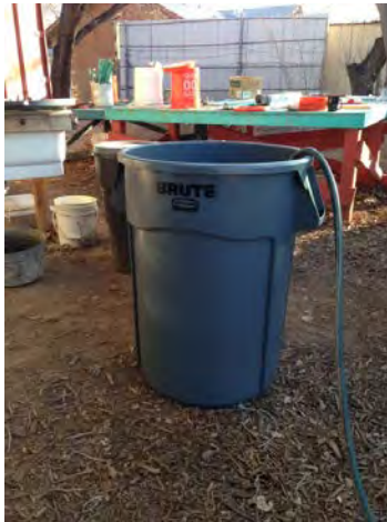
letting dilution water sit- temperature and DO level rise

5. Prepare dilution water. If we plan to dilute the tea with water, we draw the water from the well at this point to allow it to warm up