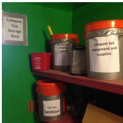
indoor storage area for equipment