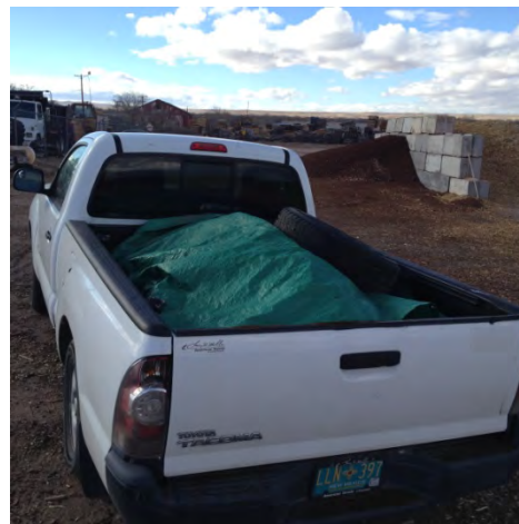
Buying compost and transporting to farm

5. Storage of the compost is important. Compost needs to be covered to prevent contamination from animals but also in such a manner that air can circulate around the compost.