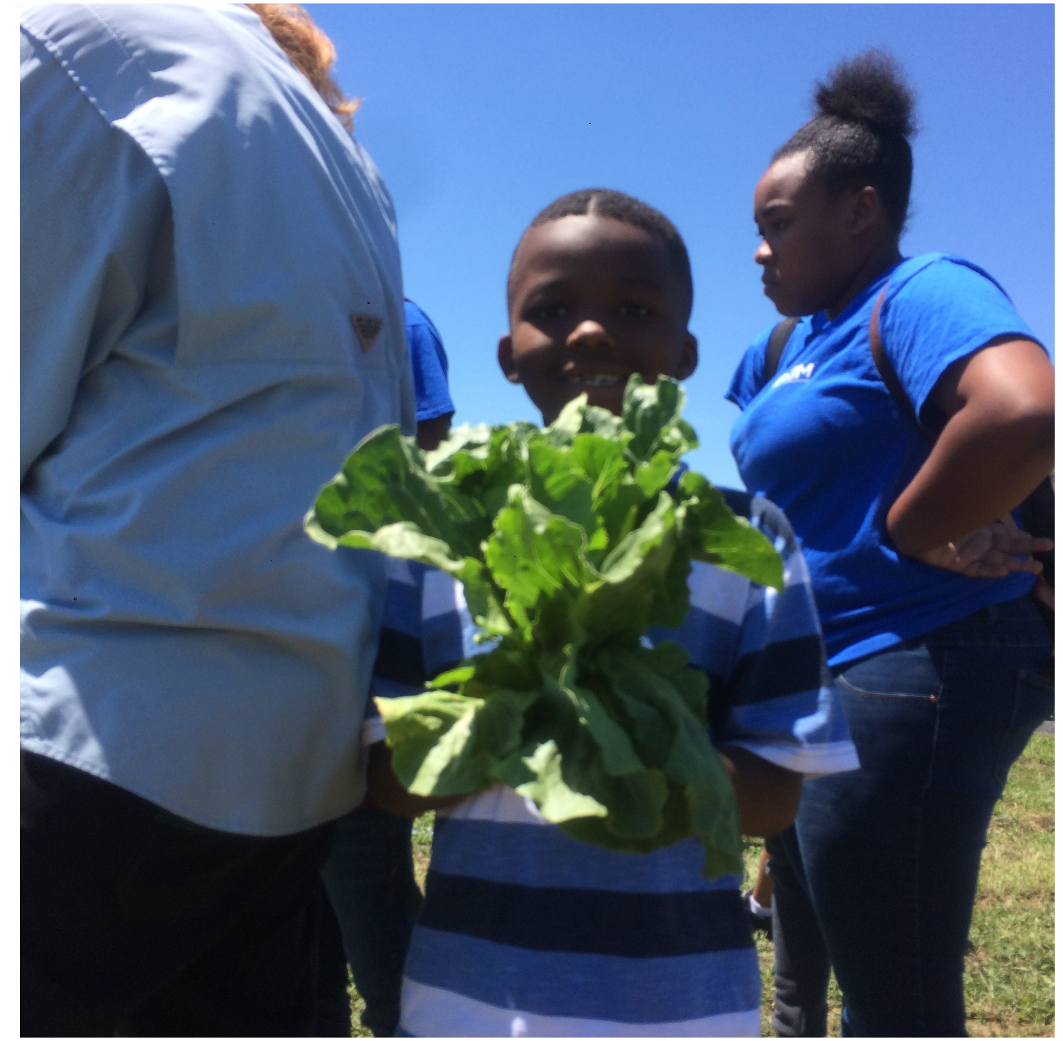
Youth workshops held at the farm with DREAM House where children ages pre K – 3 rd grade learned how to identify fresh vegetables and make easy snacks out of their harvest.

This chart tracks local food purchases made by Hendrick House in 2016 and 2017. Each of the farms listed on the left side of the graph are farms in the Champaign, Urbana area that supply local produce to Hendrick House.