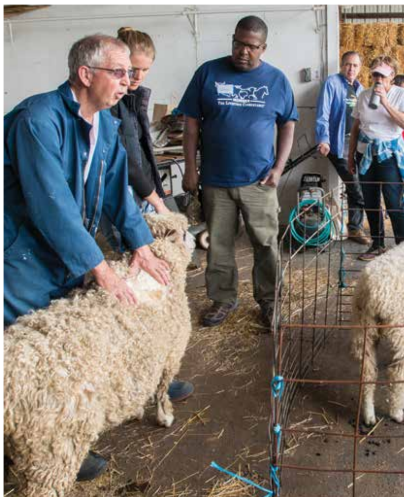
Lance Cheung, USDA