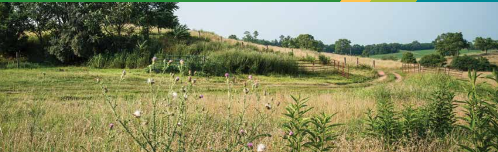
Lance Cheung, USDA

Use this sample checklist to stay organized as you make arrangements for your field day. A Word document version of this checklist is available at www.sare.org/farmer-to-farmer/tools .