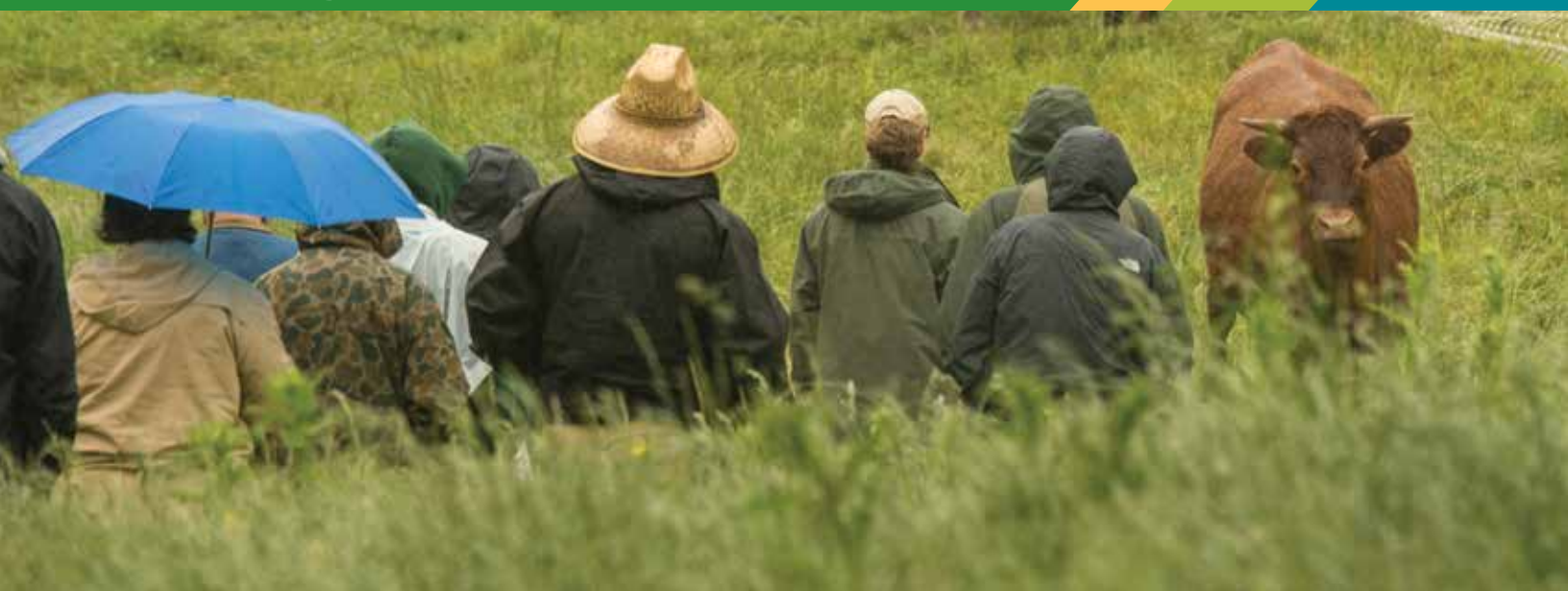
Lance Cheung, USDA