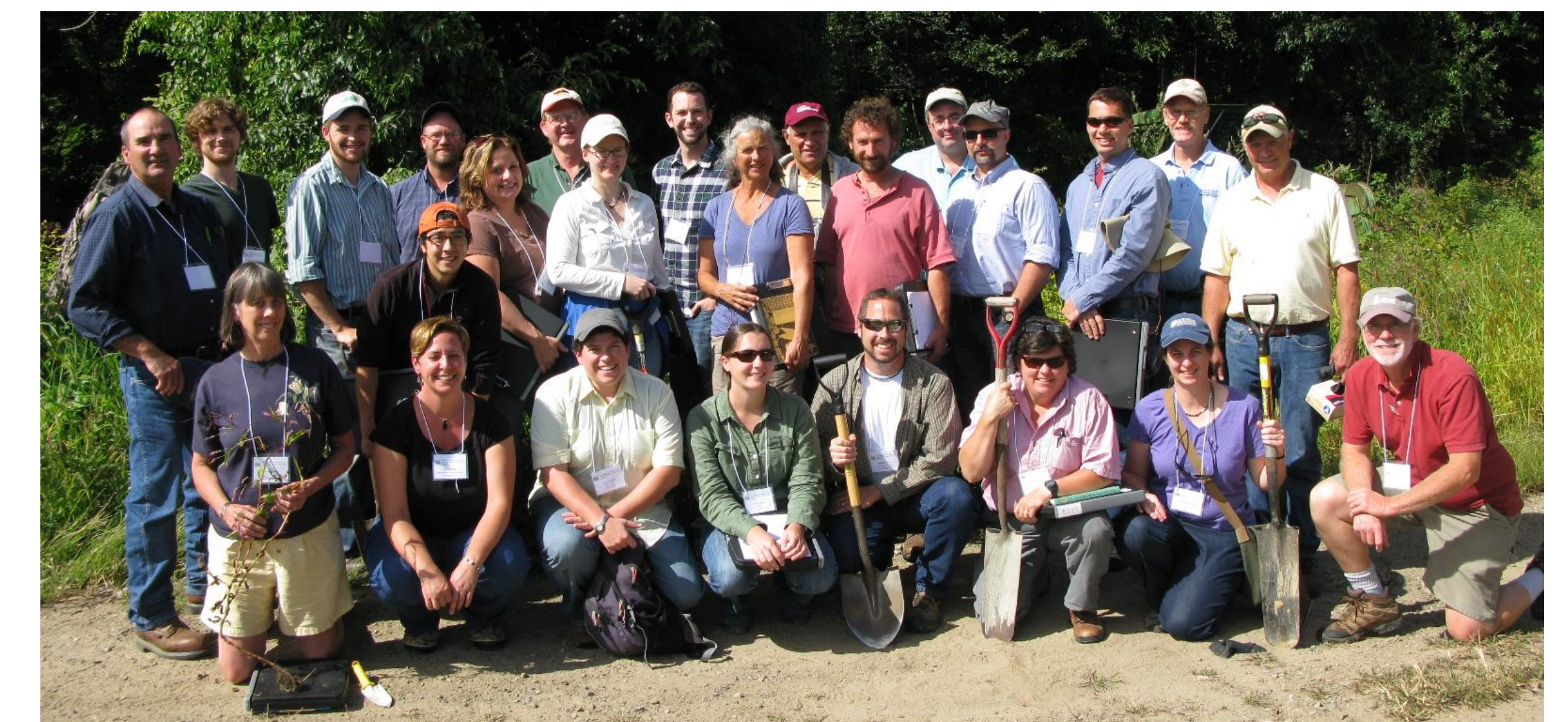
Participants and instructors at first in-service training.

This project has helped 21 Extension educators, USDA NRCS, commercial and non-profit personnel throughout New England better identify weed and forage species and study pasture and haycrop management strategies to optimize forage quality on livestock farms. The program focused on 1) training, 2) professional peer development, and 3) active experiential learning.