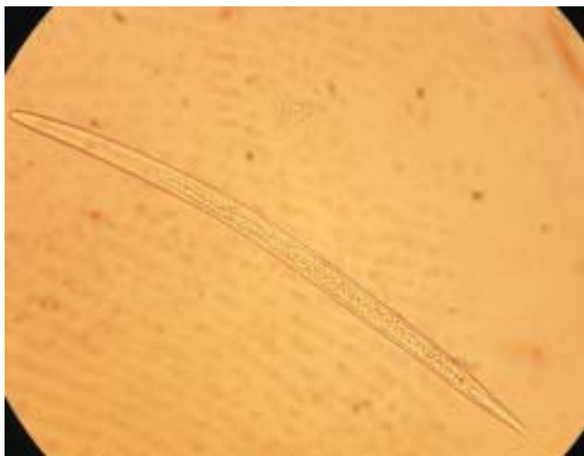
1. Juvenile root-knot nematode, 0.3 mm long, shown 300 times actual size.

Nematodes, also known as roundworms, are one of the most common phyla of animals and can be free-living or parasites of plants and animals. Root-knot nematodes are a group of nematodes that exclusively attack plant roots (Photo 1). Many important crops are susceptible to damage from these nematodes. After infecting the roots, their feeding causes development of knot-like structures known as galls (Photo 2). Several root-knot nematode females may be found within each gall. As parasites, nematodes take energy and nutrients away from the plant to support their own survival. Root-knot nematodes can severely damage crops by reducing their yield and quality. Severe infestations can lead to the death of a large number of plants and financial hardship for farmers.