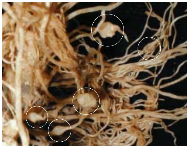
2. Galls (circled) caused by root-knot nematodes on tomato roots.

Applying organic amendments such as cover crops to the soil is an alternative strategy that is safer to the